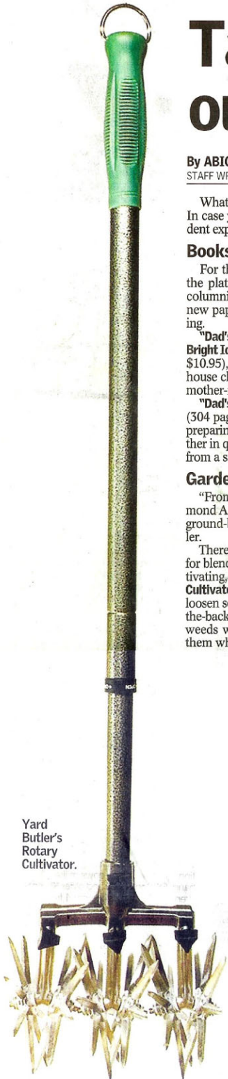
Yard Butler's Rotary Cultivator.